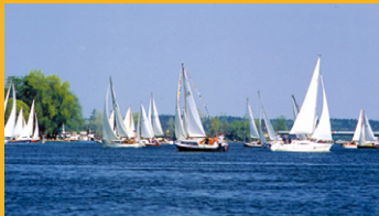
Excellent leisure possibilities in the region

The region offers a unique combination of the international flair of the Berlin metropolis and the fascinating nature and historical sights of Brandenburg. A singular club scene, renowned large events, more than 170 museums, 150 theatres as well as some 500 castles, churches and parks all attract visitors to the region. There are no limits to the sporting and leisure activities, among them golf, horse riding, water sports and flying.