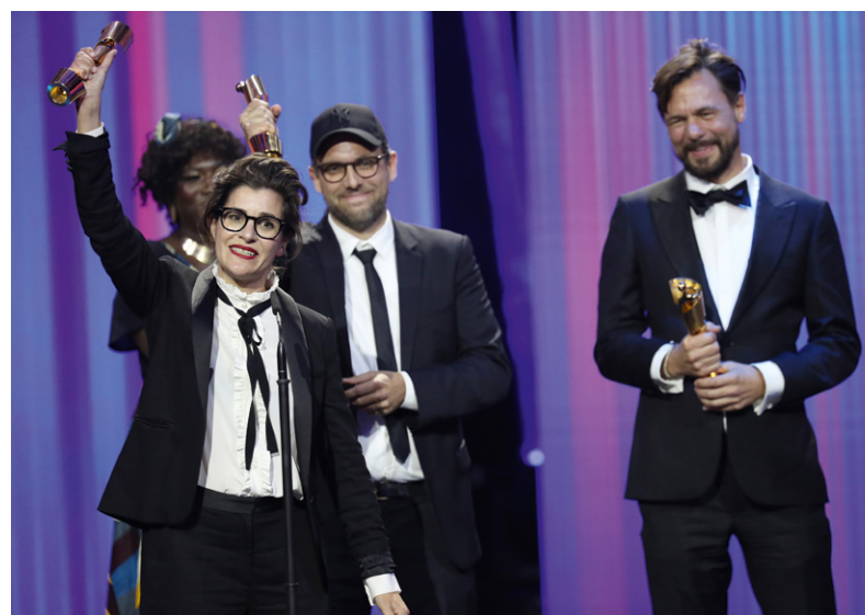
German Film Prize 2021 award ceremony

The Virtual Reality Berlin-Brandenburg association (VRBB), which organises the VR Now Awards, connects the regional stakeholders in the areas of VR, AR and XR.