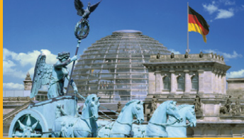
Quadrige in front of the Reichstag dome