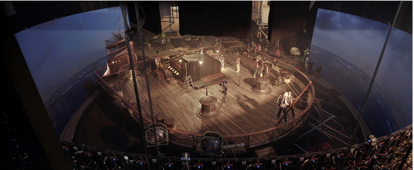
“1899”, Dark Bay Virtual Production Stage