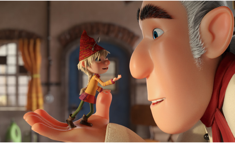
"The Elfkins | Baking a Difference", Akkord Film Produktion