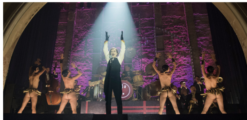
“Babylon Berlin”, X Filme Creative Pool

Productions such as “Dark”, “Unorthodox”, “Munich – The Edge of War”, “The Queen’s Gambit” or the current mystery series “1899” from “Dark” creators with a virtual stage in Babelsberg all speak for themselves. Brilliant locations and the internationally experienced film creators of all trades make the region one of the most attractive worldwide, not just for us but also for other streaming services, studios and film productions.