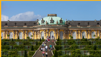
Sanssouci Palace in Potsdam

Berlin-Brandenburg offers tailor-made funding programmes for innovations, investments and the qualification of professionals. Funding is provided by the European Union, the Federal Government and the states of Berlin and Brandenburg.